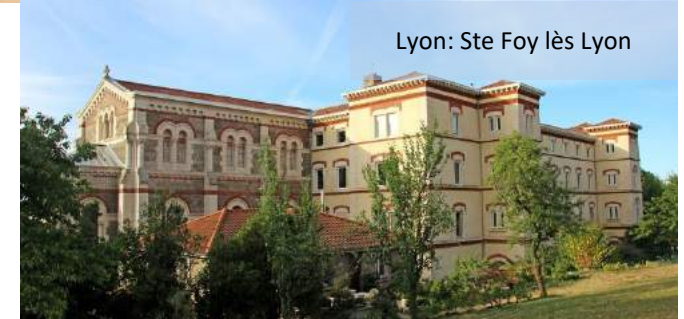
Lyon: Ste Foy lès Lyon