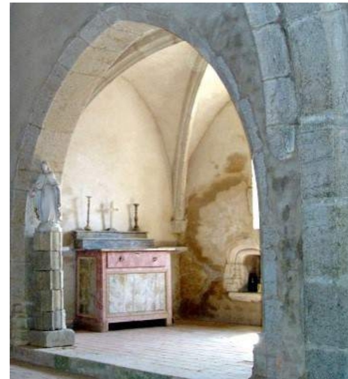
The remote, abandoned parishes of the Bugey mountains became the first mission fields of the pioneer Marists.

10 Finally, keep a light touch; find things to laugh about. It loosens up your head and your nerves.