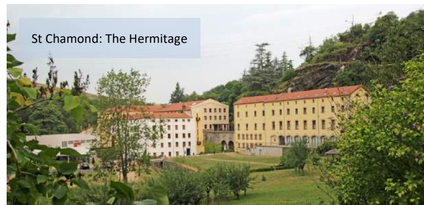
St Chamond: The Hermitage