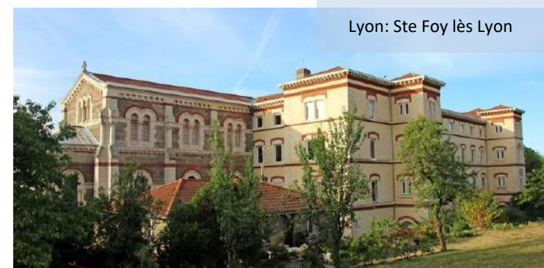
Lyon: Ste Foy lès Lyon