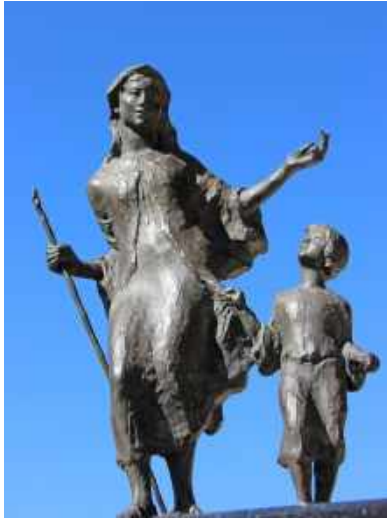
Our Lady of the Journey

The name Marist is not an empty title. Come, if we are Marists, it must be seen in our conduct.