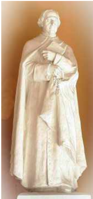
Villa Santa Maria, Rome