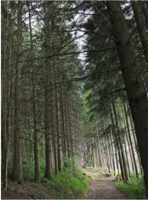
Barbery forest, near the birthplace of Jean-Claude Colin

Jean-Claude Colin was the founder of the Marist Fathers – priests and brothers of the Society of Mary