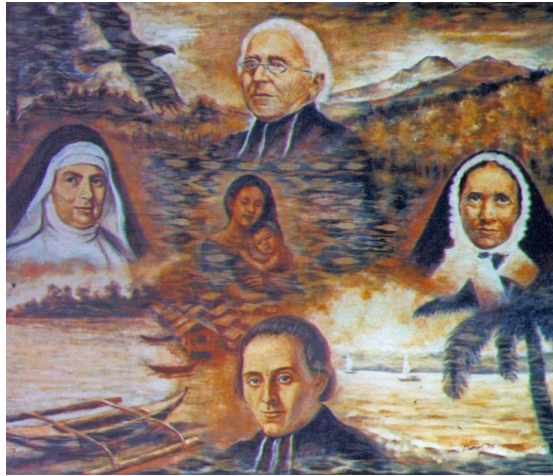
Four Marist Founders with Mary & Child-Jesus