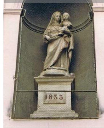
Statue erected by Fr Colin at the college of Belley in 1833

of Fr Colin, i.e., Working with God, we form Catholic/Christian Persons, Upright Citizens who useful are to society, and Academic Scholars (People of Letters). If understood and practiced well, Fr Colin's formula for educational success continues to work for Marist Fathers and Brothers schools.