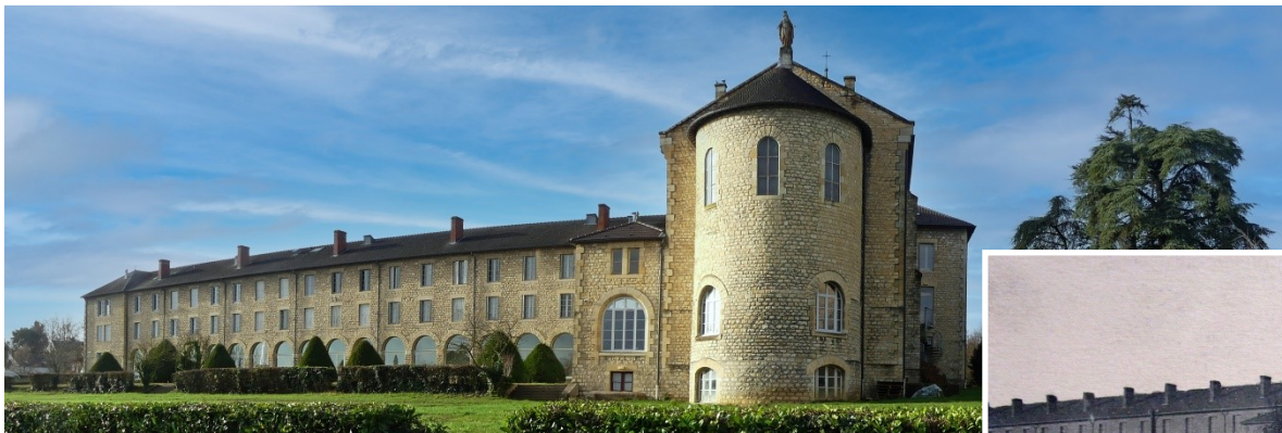
Grand seminaire of Nevers, today and in 1852